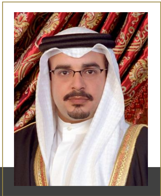
His Royal Highness Prince Salman bin Hamad Al Khalifa The Crown Prince, Deputy Supreme Commander and Prime Minister