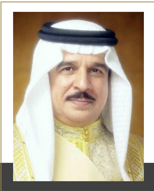
His Majesty King Hamad bin Isa Al Khalifa King of the Kingdom of Bahrain