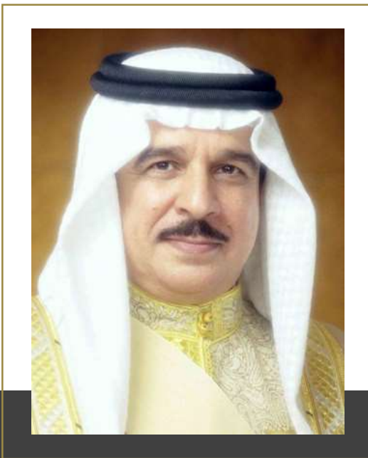
His Majesty King Hamad bin Isa Al Khalifa